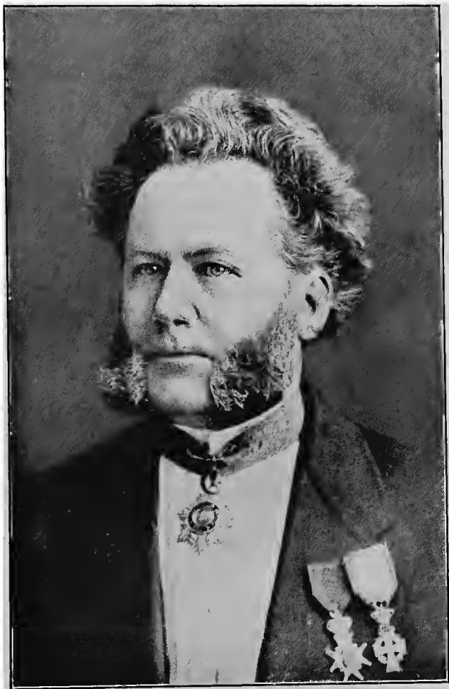
Ibsen in Dresden, October, 1873.